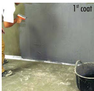
Applying a 1st coat of IMPERTOT.