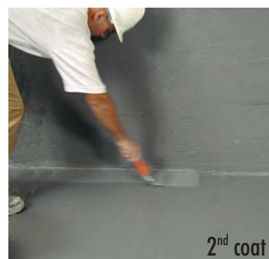
Applying a 2nd coat of IMPERTOT.