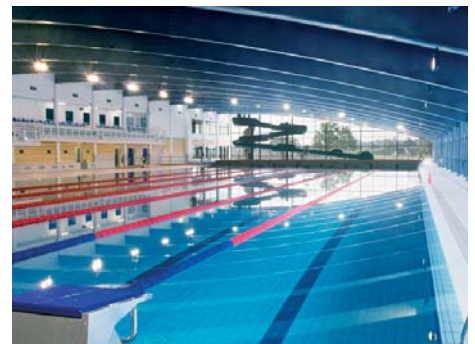
Ideal for laying tiles in swimming-pools.