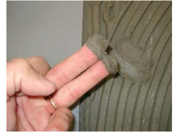
Make sure that the adhesive stays fresh.