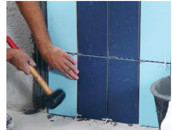
Use a rubber mallet.