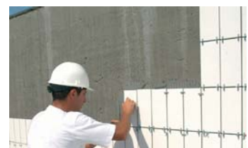
Laying onto the waterproofing