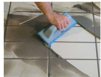
Grout the joints 4 hours after tiling.