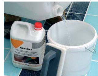
If necessary, use GRESNET .