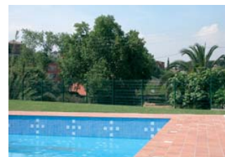
Hydro-repellent grouting in swimming-pools.