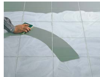
Use the FIX-TROWEL FOR CLEANING .