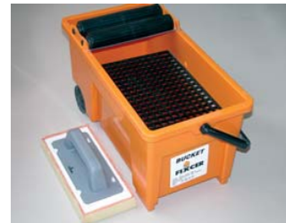
Use the FIX-BUCKET and the FIX-SPONGE .