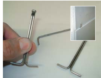
Select the best anchorages.