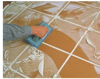
Grout the joints 24 hours after tiling.