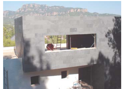
Ideal for exterior façades: highly flexible.