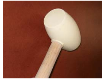
Use a rubber mallet.