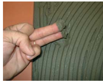
Make sure that the adhesive stays fresh.