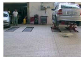
Ideal for laying as you go along.