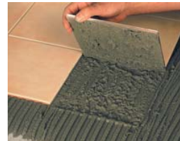
Check the adhesive is fresh.