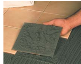
Check tile-adhesive contact.