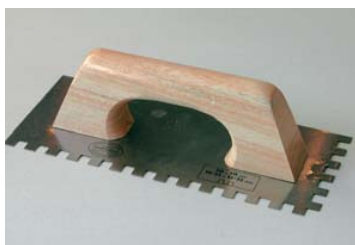
Use a notched trowel.