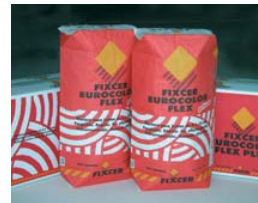
Seal 4 hours after laying tiles.