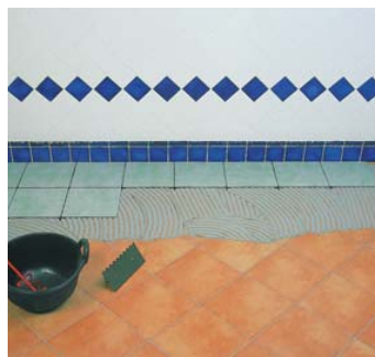
Cementitious adhesive ideal for overlays.