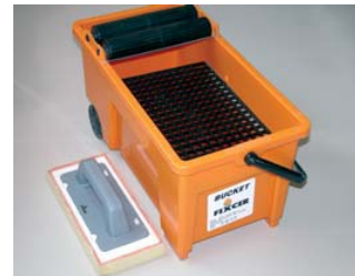
Use the FIX-BUCKET and the FIX-SPONGE .