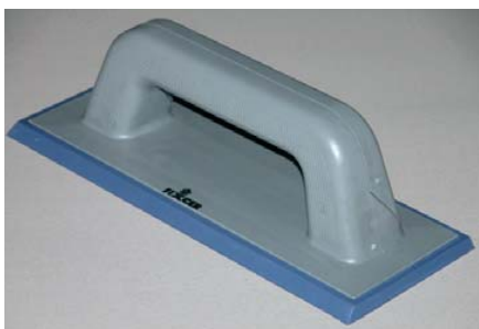
Use the rubber FIX-SPATULA .