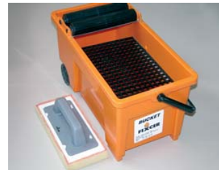
Use the FIX-BUCKET and the FIX-SPONGE .