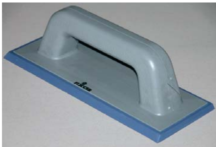
Use the rubber FIX-SPATULA .