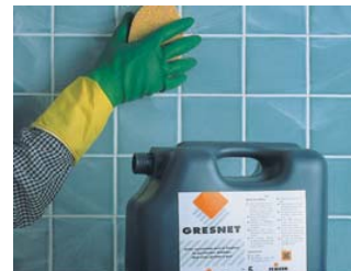
If necessary, clean with GRESNET .