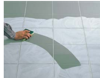
Carry out a dry cleaning.