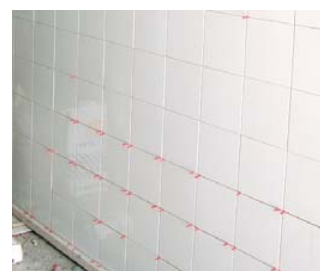
Inexpensive, long- lasting grouting.