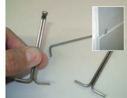
Choose the best fixing.