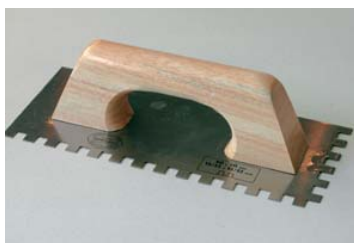
Use a notched trowel.