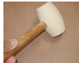
Use a rubber mallet.