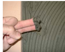
Check the adhesive is fresh.