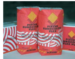
Seal 90 minutes after laying tiles.