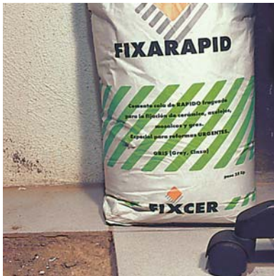
Urgent office repairs

We recommend the use of a specific material like FIXCOLOR (fine or thick grain), EURO-COLOR FLEX , EUROCOLOR FLEX PLUS , JUNTATEC or CERPOXI . Use SELLALASTIC on the expansion joints.