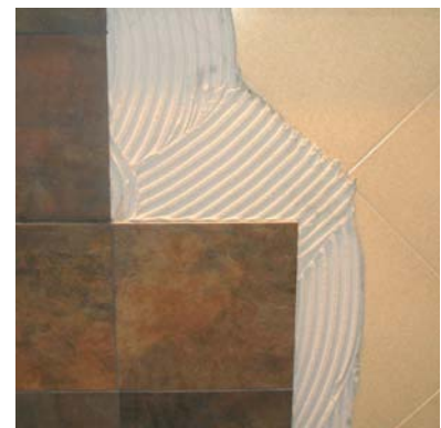
Placement of stoneware on porcelain stoneware, etc.

Mix with clean water until homogenous (5.8 litres of water per bag); use an electric mixer at a low rpm to prevent the formation of lumps. Let it sit for 2 minutes and remix. The mix will then be ready for use.