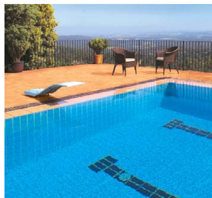
Waterproofing on unstable ground.