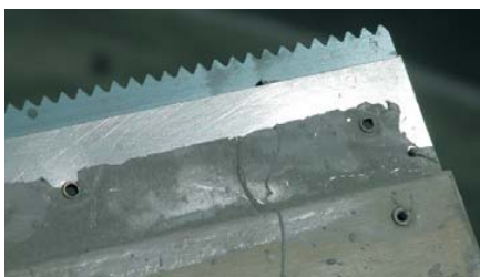
On floors: use a 3 mm trowel.