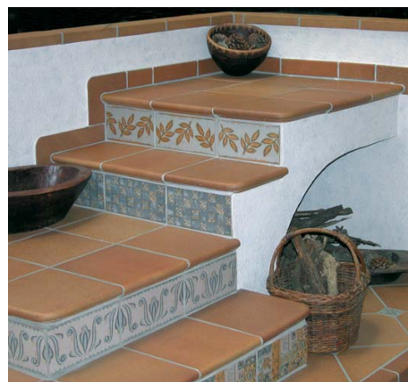
With FIX-CERA , floors can be beautified.