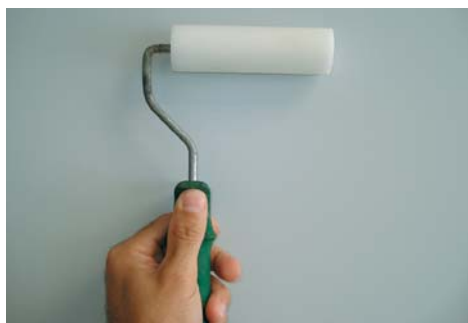
Use a varnish roller to apply FIX-CERA .